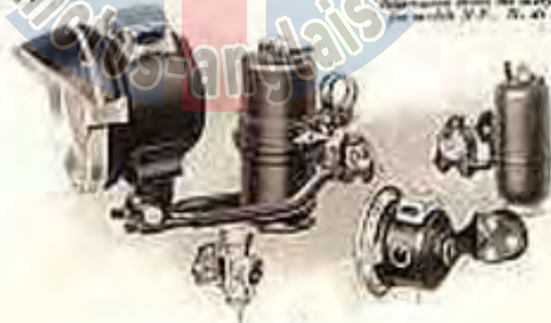
Illustration shows the acetylene set supplied for models V.P. 25, 45, 50 and T.T.

The Lucas bulb horn is neat and compact and produces a pure penetrating note of good carrying power.